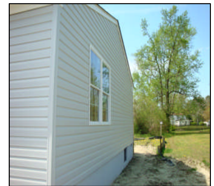
Low Maintenance Siding